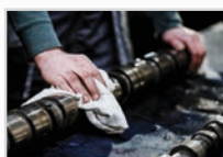
Suitable for Wiping, Polishing & Dusting