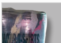
Compressed for easy storage